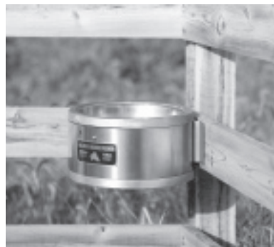
Corner mount in pasture