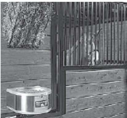
Mounts on most swing out doors.