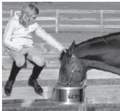
Fence mount in pasture