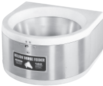
540se Wall Mount