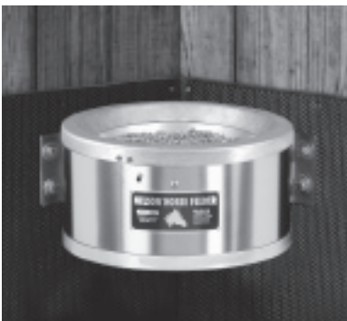
Corner mount in stall