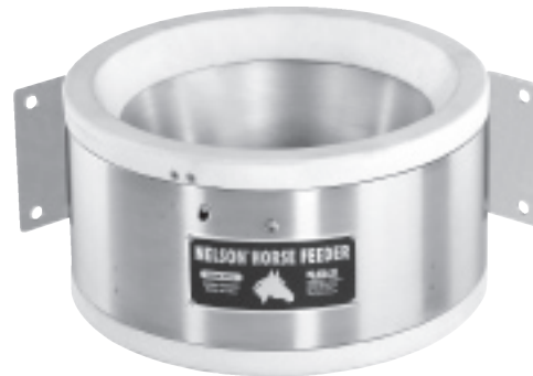
560se Corner Mount